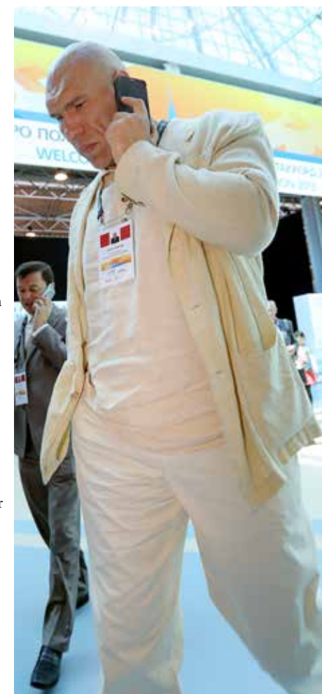
STAR: Nikolai Valuev at SportAccord Convention

Delegates could hardly miss the arrival of the retired two-time world champion, who stands at a towering 210cm.