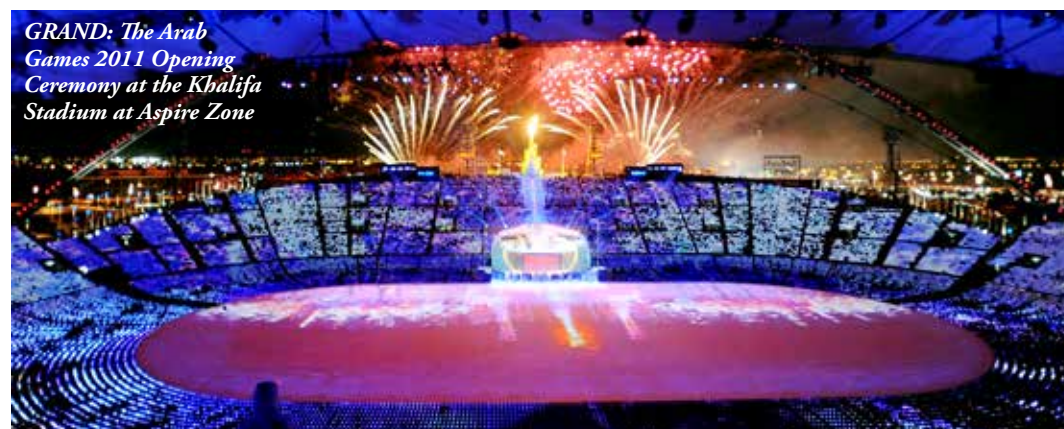
GRAND: The Arab Games 2011 Opening Ceremony at the Khalifa Stadium at Aspire Zone

FAM: "Our main focus is preparing for the 2014 FINA ARENA Swimming World Cup and the 2015 IHF Handball World Cup events as well as preparing bids for hosting future sporting events. At the same time our focus is on preparing for the future developments that form part of the 2011-16 Sports Sector Strategy."