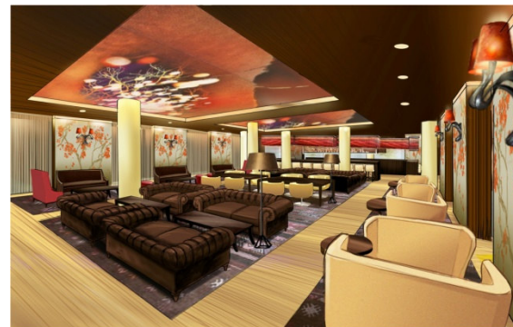
Artist impression bar (refurbishment finished in May)