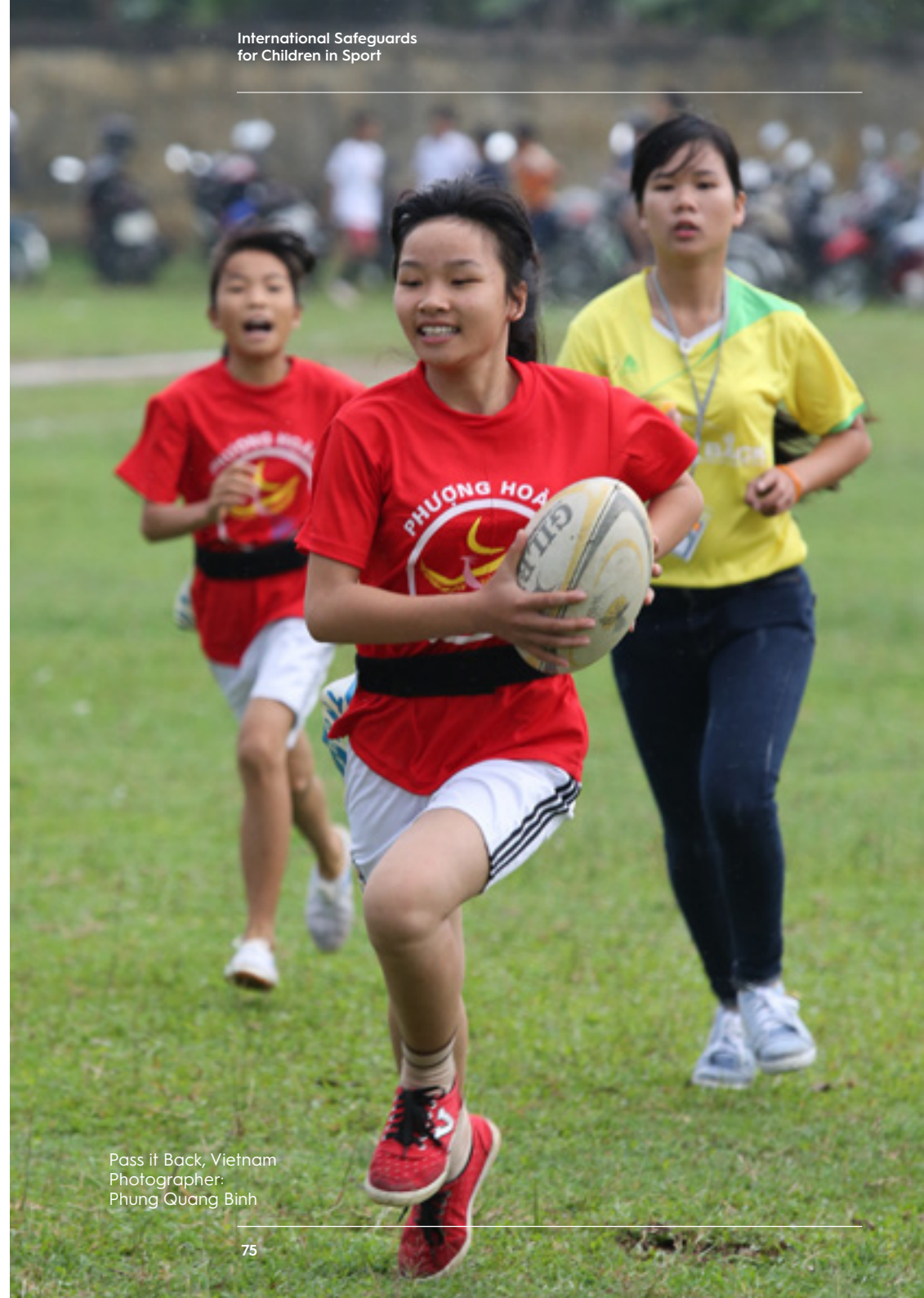
Pass it Back, Vietnam

Head of Learning Sport for Development Organisation Asia