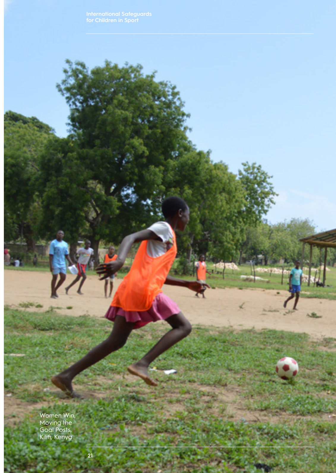
Women Win, Moving the Goal Posts, Killif, Kenya

For us safeguarding comes from the perspective that children have rights, and they have a right to know their rights! Executive Director, Moving the Goalposts