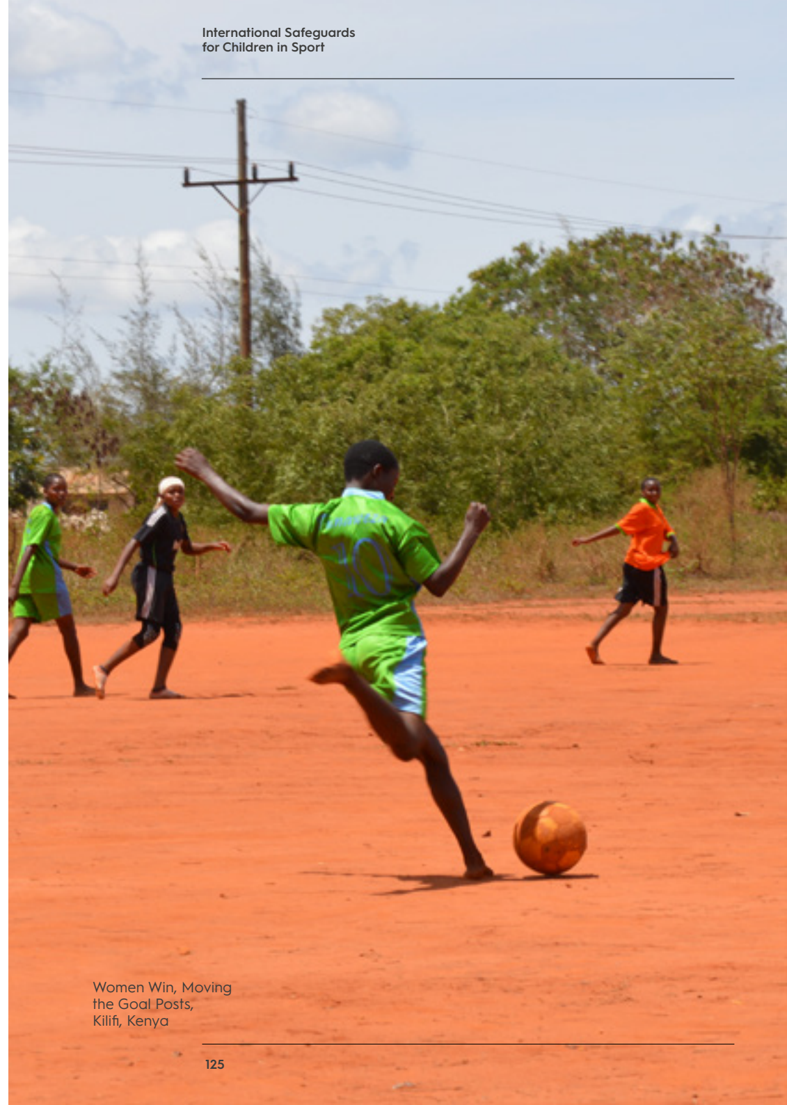
Women Win, Moving the Goal Posts, Kilifi, Kenya

“Before the policy we would finish peer leader meetings and girls would be going home in the dark and that’s a safeguarding issue in itself. Now with the policy we know that at 3pm we have to finish so everyone has enough time to get home before its dark.” Staff member Moving the Goalposts Africa